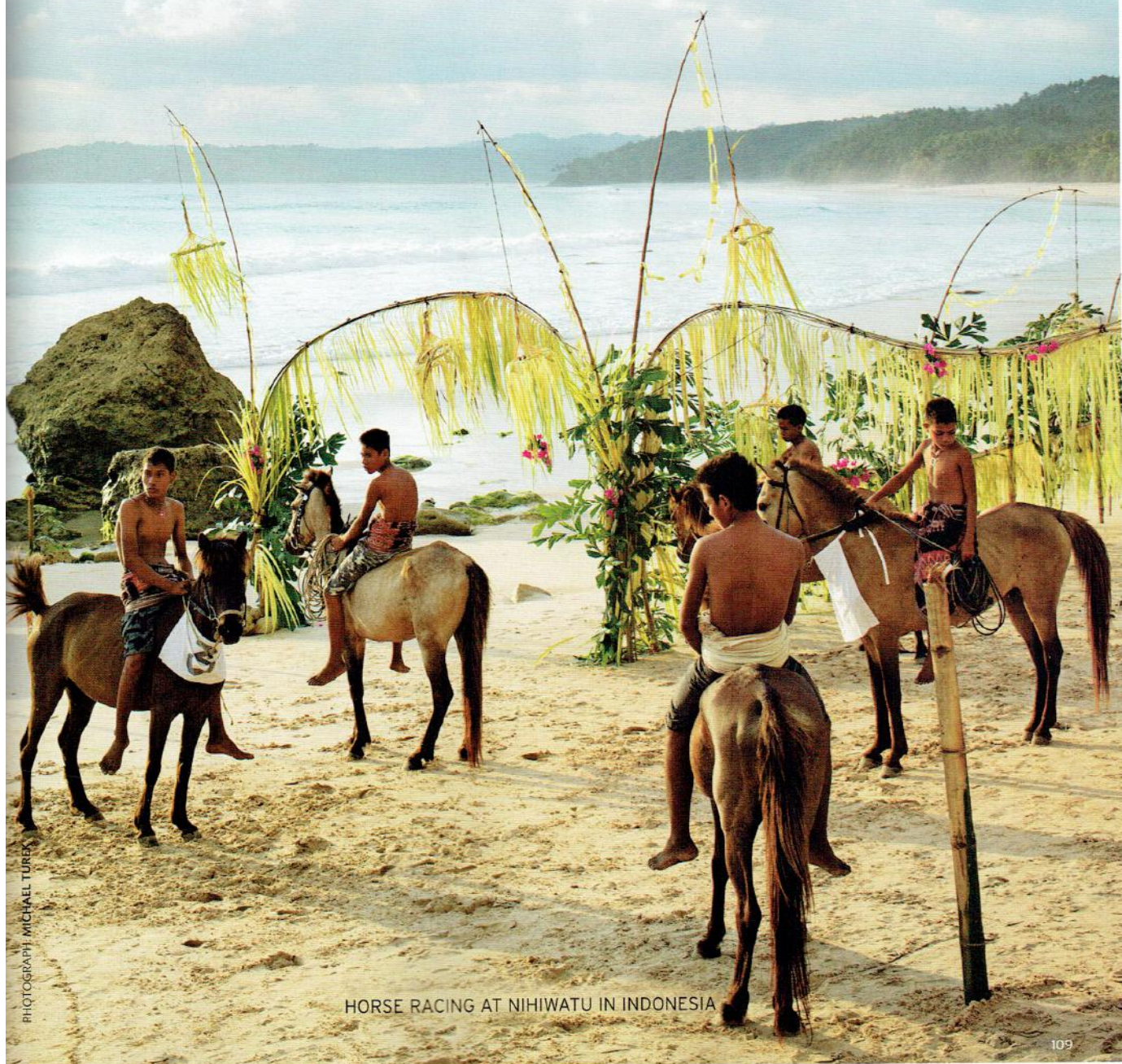
HORSE RACING AT NIHIWATU IN INDONESIA

OUR ALL-TIME FAVOURITE HOTELS, RESTAURANTS, COCKTAIL BARS AND BEACH CLUBS