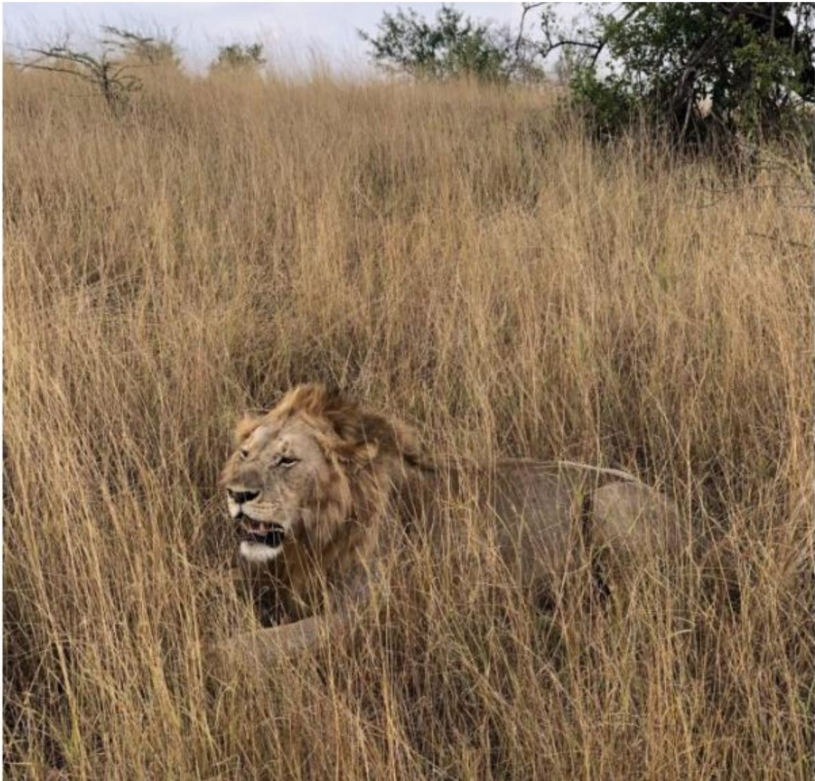
A lion on the Singita reserve.

There are intelligence networks to gather information about potential pending poaching operations in the surrounding villages, there's data collection of incidents and shots fired. They track animal movements and gather a deep understanding of the supply chain of munitions used by poachers, as well as a granular level of detail of the human networks that are driving the trade. Think the photos taped to the wall in The Wire or Homeland , but with more technological sophistication and real-time adaptation.